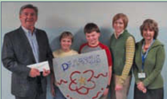
Damascus School Students receive a grant from the Youth Advisory Program. The project enabled the students to do an in-depth study of the Middle Ages.

The Foundation establishes funds bearing the names of their donors, while other funds bear the names suitable to their objectives. Our management of a fund is the opportunity for individuals or groups to make donations directly to these separate accounts or to establish new funds. As we are a charitable and tax-exempt institution, contributions are deductible from federal income taxes. Another advantage is that once a fund is established it can continue into the future.