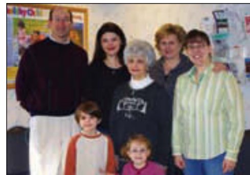
Showcase Fund: L.E.A.P.S. (“Let Every Ability Play Safe”) and Bounds Playground Project. This fund was established to raise funds in order to build a safe and accessible playground for special needs children.