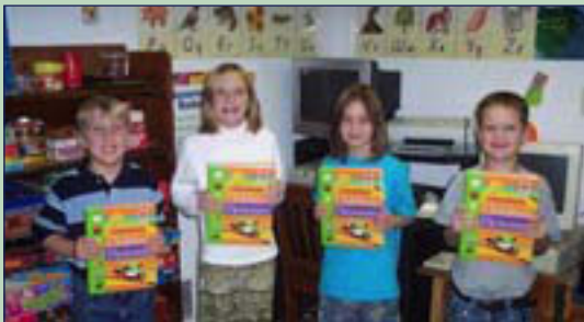
Damascus Christian 3rd Graders with their new Dictionaries.